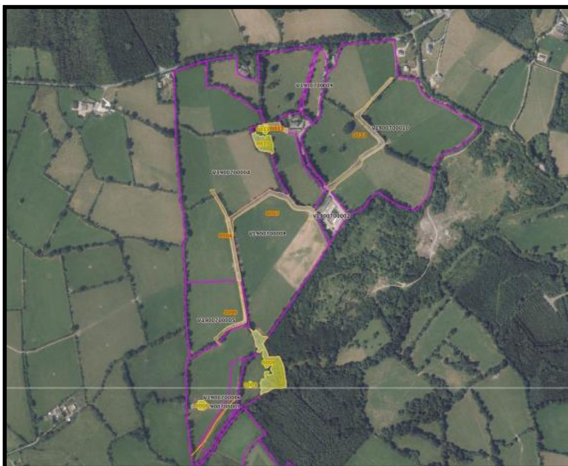
Map of Holding (exact boundaries may vary)